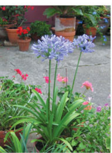
Agapanthus africanus 'blue'