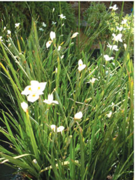
Dietes 'fortnight lily'