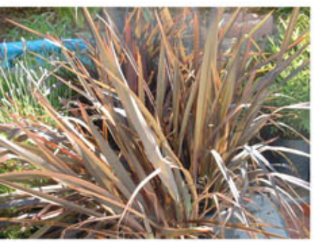
Phormium tenax 'Rainbow warrior'