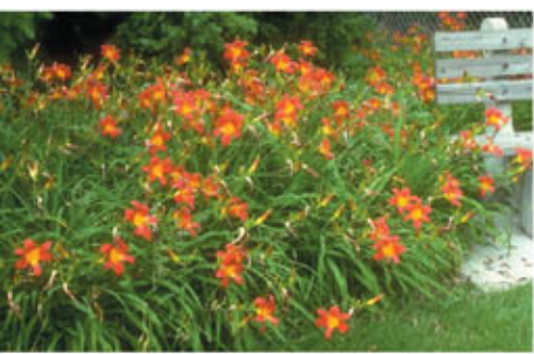
Hemerocallis 'Lighting berry'