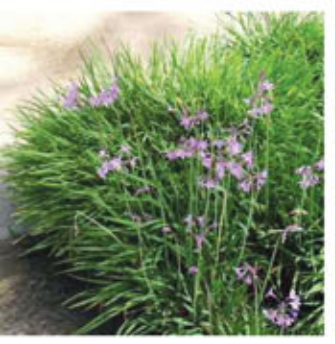
Tulbaghia violacea 'green'