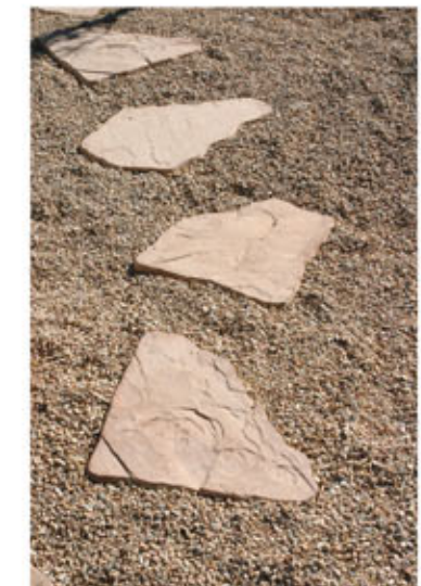
Man-made Rock Steps