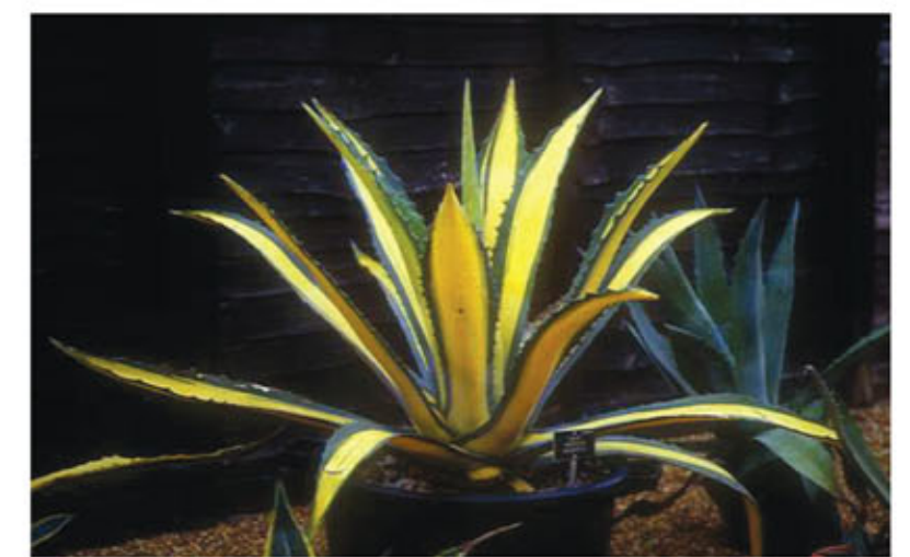
Agave americana variegata