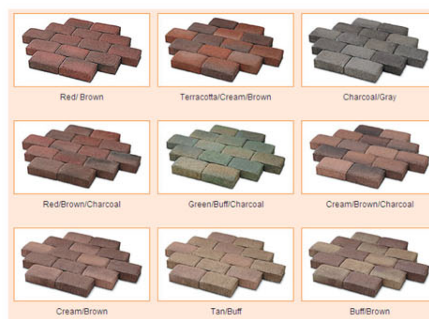
Antique Cobble Pavers